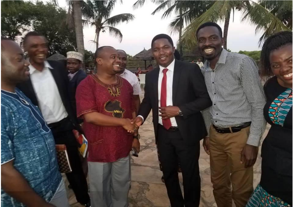
Photo: The Guest of Honour Mr.Suleiman Japho(centre),the Minister in Prime Ministers Office Regional Adiministration and Local Government Authority (PMORALG).