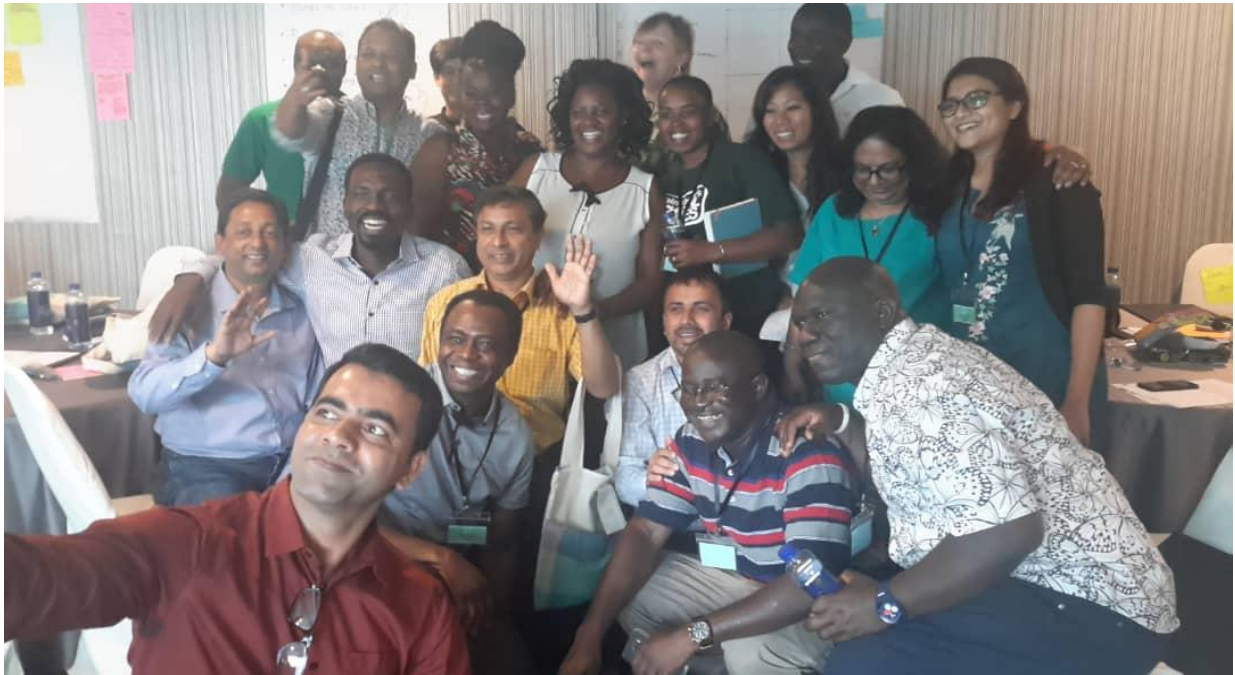
Photo: A cross section of Child Hope Partners from Africa, Asia and Europe

safeguarding conferences and summit. Elimu Mwangaza presented on Implementation of Safeguarding Policy: Mainstream Safeguarding in our work. One of the outcome of the conference was a strengthened capacity of individuals and organizations on safeguarding Policy and Practice.