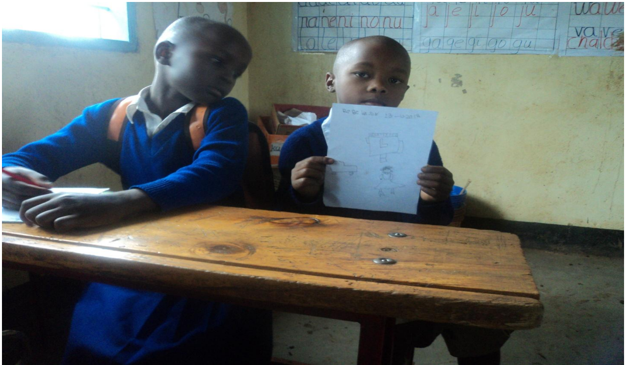
Photo: Student at Karanga Primary school presenting his picture showing the rights he deserved.