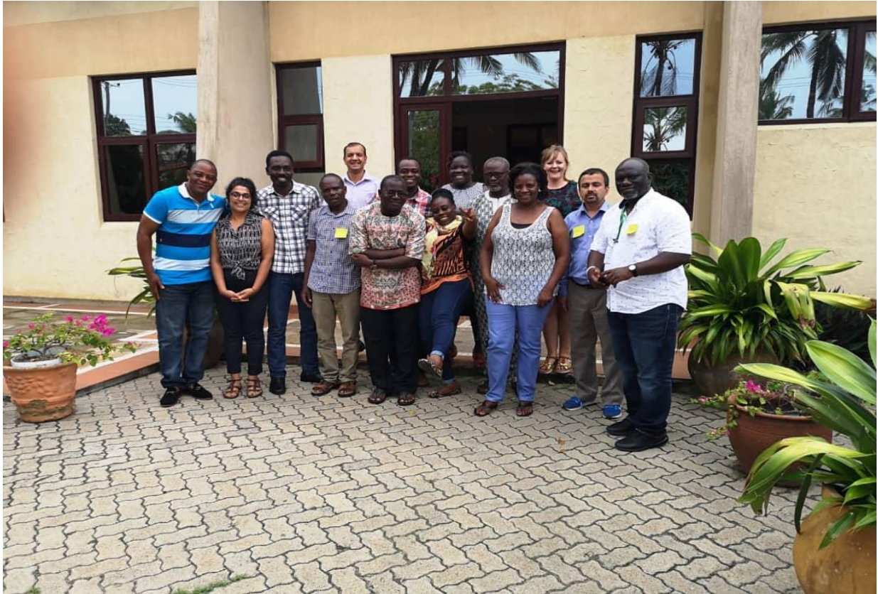
Photo: A team of Child Hope Partner organizations from Africa, Asia and Europe that form South to South Initiatives on Child Protection and Safeguarding during the 1st Workshop in Mombasa, Kenya.